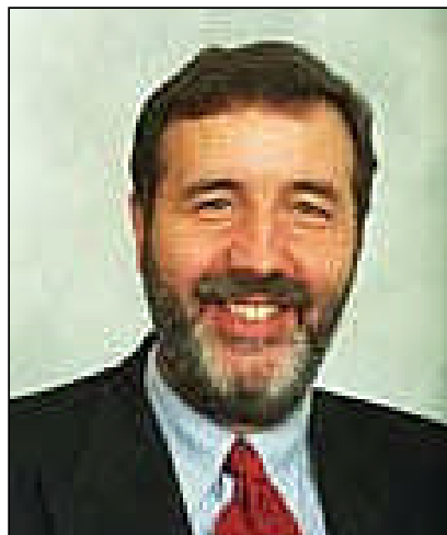
PADDY TIPPING, MP FOR THE SHERWOOD CONSTITUENCY